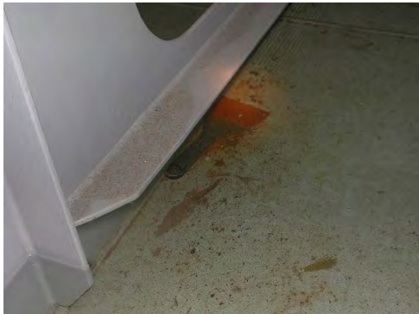
Ensure that all tools, equipment and materials are removed from the space upon completion of work

Gas detection equipment should be retested and calibrated in line with manufacturers' instructions before being stowed away ready for the next occasion, and