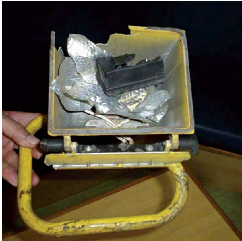
This non-intrinsically safe halogen lamp was placed just inside the door of a boiler steam drum shortly after it was opened for inspection following a chemical clean. The tank atmosphere exploded causing fatal injuries to one of the personnel outside the steam drum door.

So far as is safe and practicable, all accesses to the space should be opened to maximise air flow and aid the evacuation of the space in an emergency. Suitable signs and barriers should be placed near each access prohibiting entry, and any openings in the deck should be fenced off to prevent injury.