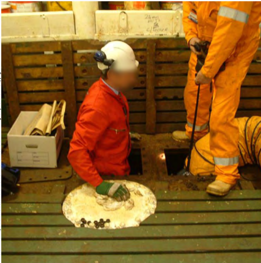
The restricted manhole opening into this chain locker made it difficult to access the space whilst wearing SCBA and to recover the persons who had collapsed inside