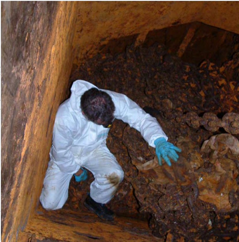
Photo: MAIB Report on the death of three crewmen on board ERRV Viking Islay.