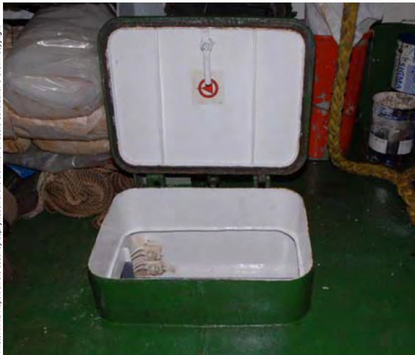
Photo: MAIB Report on the death by asphyxiation of two crewmen on board Sava Lake. © Crown Copyright

When testing for gases it is important that all levels of the space are checked. Some gases are heavier than air (eg hydrogen