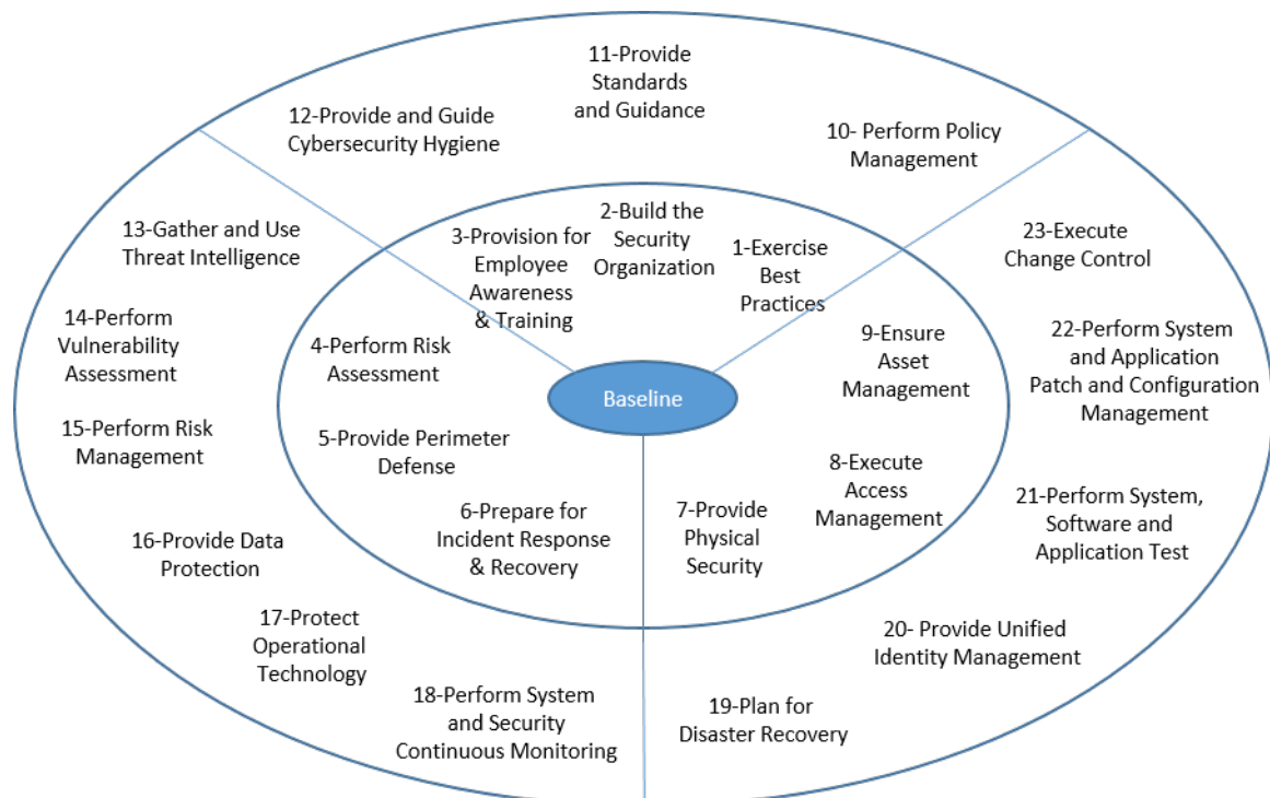
FIGURE 2 Developed Capability Set

The outside layer of the Developed Capabilities Set provides relative completeness to an organization having a need, a level of maturity, and available resources to establish a well-formed cybersecurity system. A third set of capabilities (not shown), provides guidance for a fully formed, highly capable cybersecurity system.