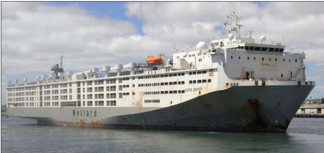
Figure 1: Ocean Drover