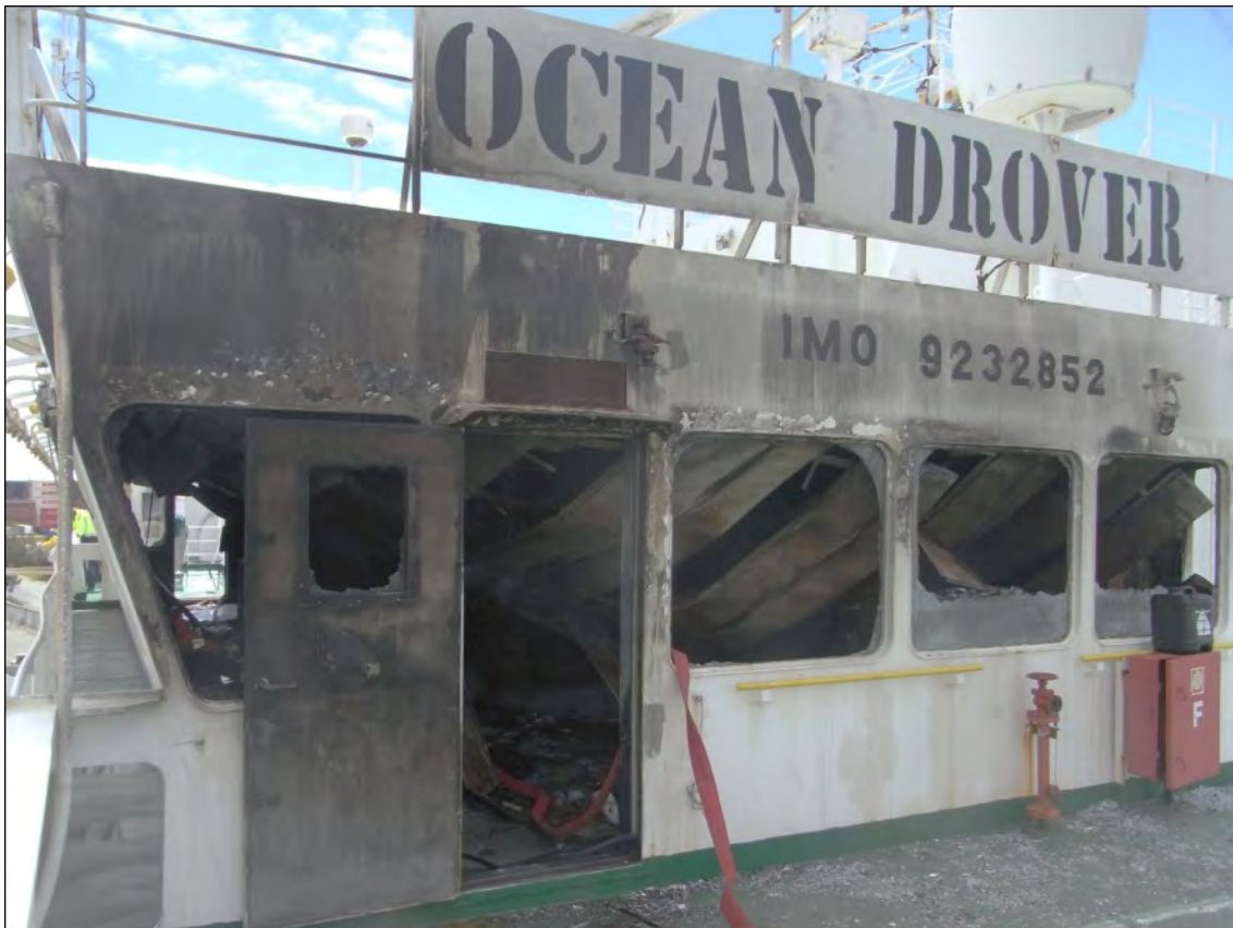
Figure 8: Burnt out wheelhouse viewed from the port bridge wing (chartroom is aft)

No evidence was found to suggest that the fire breached the wheelhouse deck or aft bulkhead. The DFES investigation found that the most severe damage was in the area adjoining the ship's office. Firefighters also observed that the wheelhouse was at the point of imminent flashover at about 1200. It is likely, therefore, that a combination of the intensity and duration of the fire exceeded the fire rating of the wheelhouse boundaries. This led to ignition of combustible materials and the destruction of the wheelhouse.