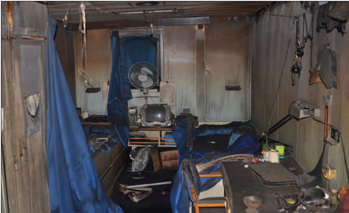
Figure 6: A two-berth cabin after the fire (note fuel load and possible ignition sources)

Furthermore, Ocean Drover had multi-berth cabins. Such cabins increased the density of the combustible materials within the accommodation space. Therefore, once the fire began, there was a significant amount of closely stowed, combustible material available to burn.