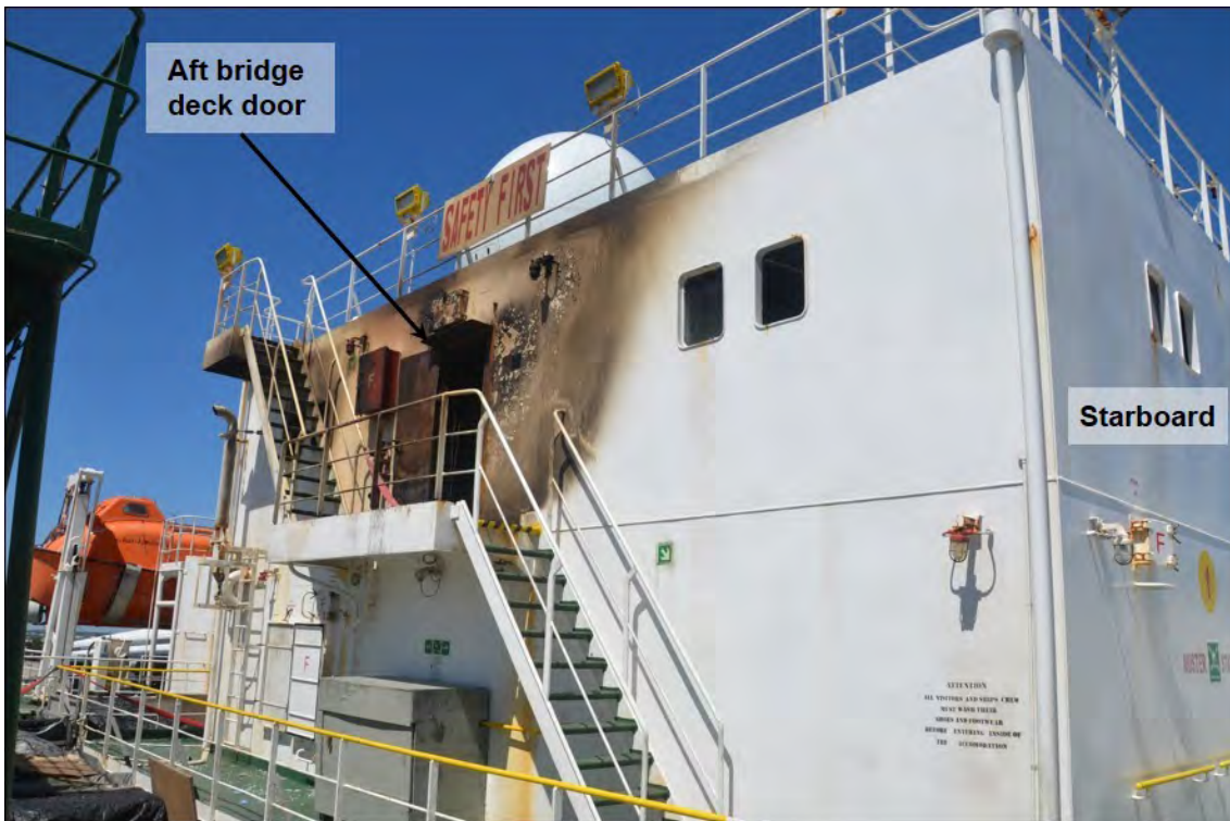
Figure 7: Bridge deck aft (note the damage near the door, which was initially open)

A fundamental firefighting technique is to ensure a fire is confined within its compartment of origin by closing all compartment openings such as doors and windows. On Ocean Drover , the fire would not have spread as easily as it did, and the damage would not have been as severe as it was, if the cabin door and the bridge deck fire doors had been closed.