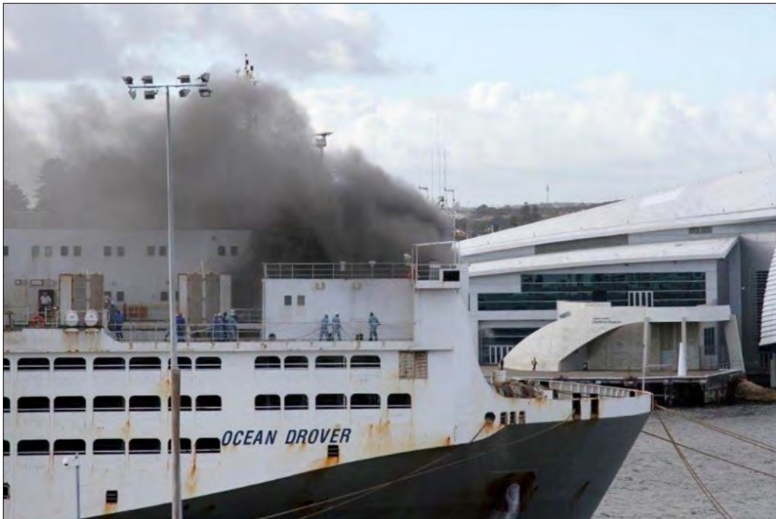
Figure 9: Ship's crewmembers fighting the fire with water hoses