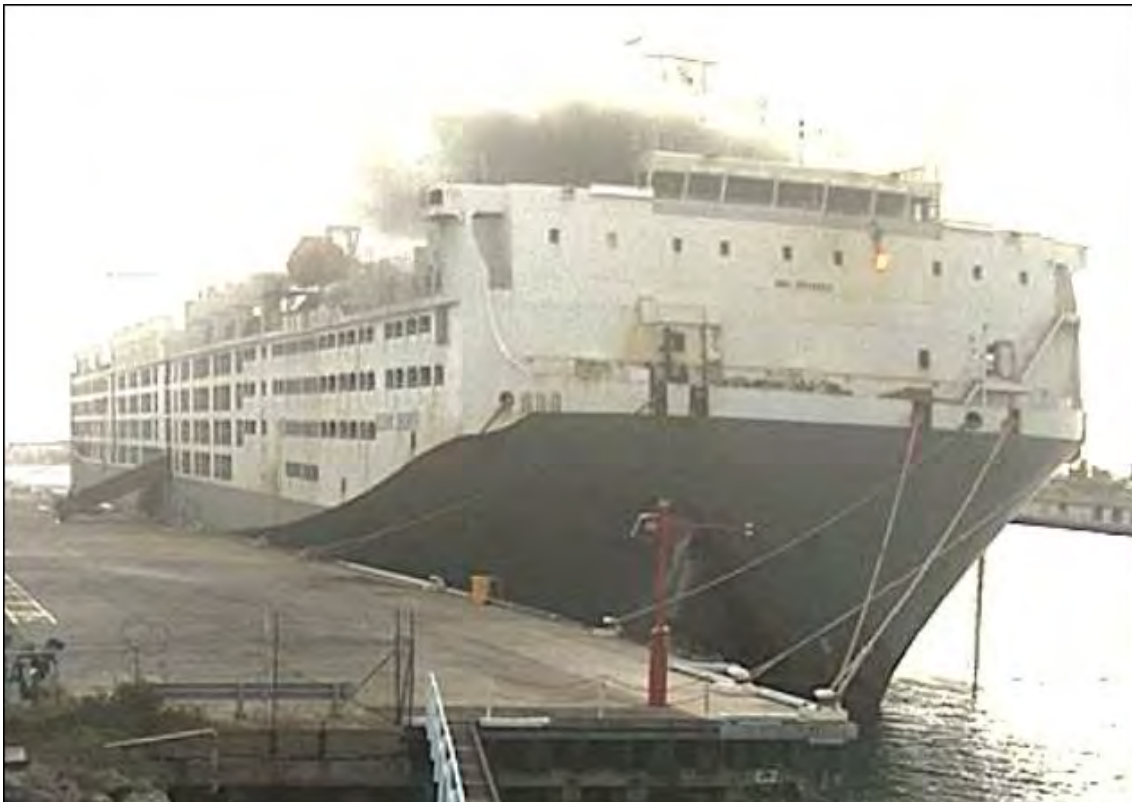
Figure 4: Wharf CCTV footage at about 0800 clearly shows flames in cabin 4