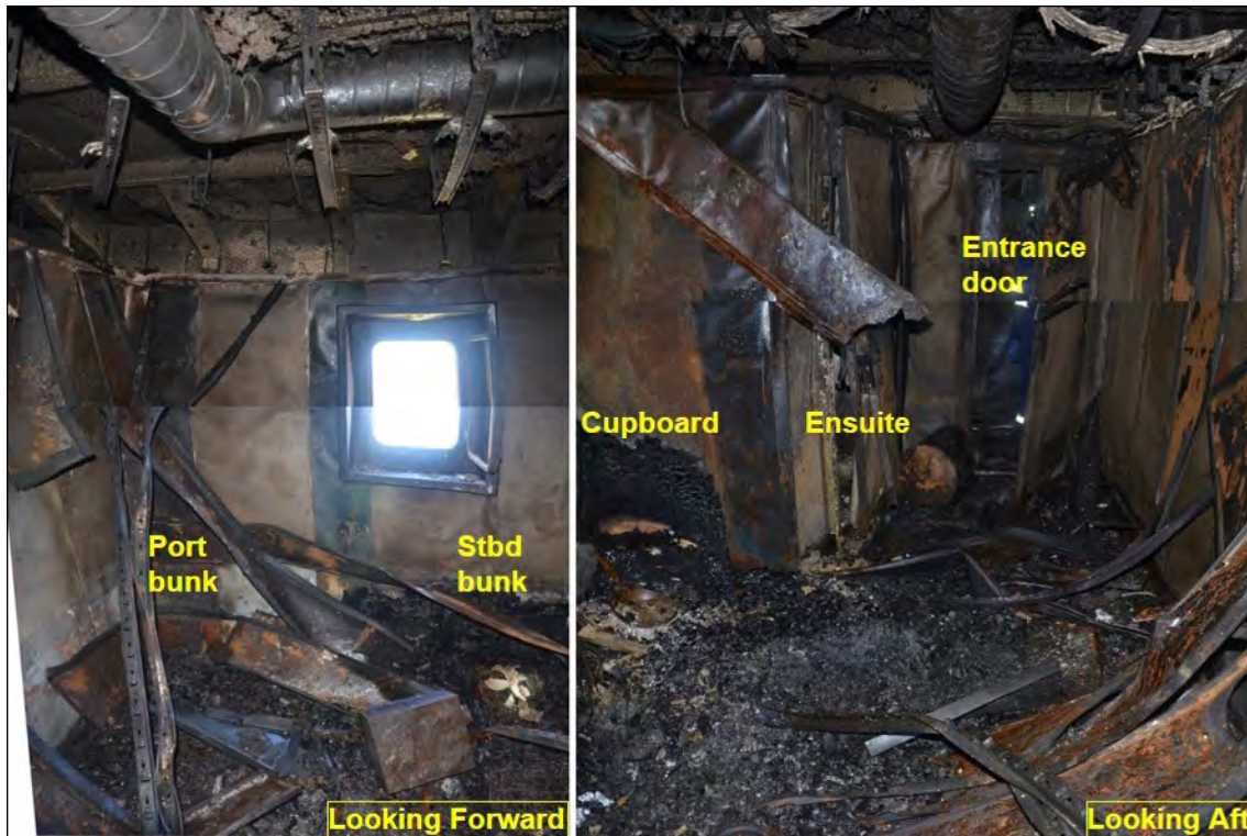
Figure 5: Interior of cabin 4 when first accessed after the fire

The fire burned for several hours at temperatures that exceeded 1,100 °C. As a result of the intensity of the fire and the severity of the damage, an exact point of origin or source of the fire could not be identified. However, the evidence, including witness statements, indicates that the fire originated in cabin 4 (Figure 5). The arson squad did not find any evidence of suspicious activity.