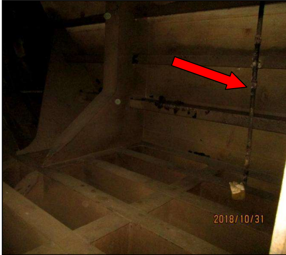
Figure 4: Valve spindle inside the forepeak tank

spindle passing the whole height of the tank, split in sections by cardan joints and supported at several locations through the platforms. The valve spindle (Figure 4) was located about 1.5 m from the access ladder.