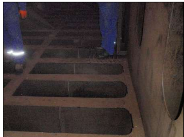
Figure 3: Platform no. 5 with deep wells

The depth of the bottom longitudinal girders was about 1.9 m, and the face plates were about 0.25 m wide, providing just enough stepping space.