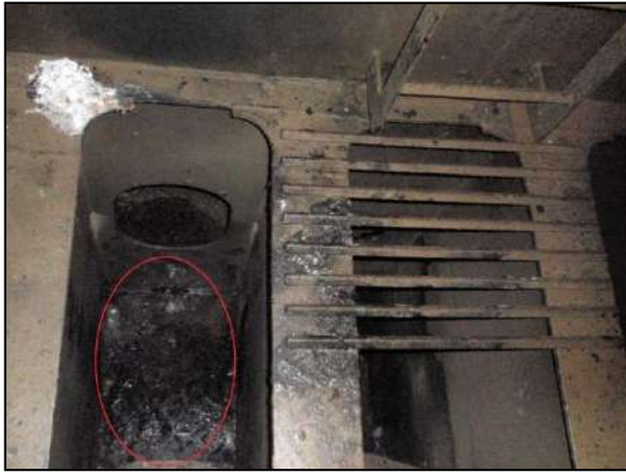
Figure 6: Bilges inside the forepeak tank