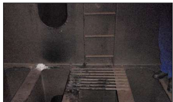
Figure 5: Vertical ladder on platform no. 5

Soon after, both fitters’ clothes were on fire; while fitter 2 managed to reach the ladder and climb up to the upper platform (Figure 5), fitter 1 did not manage and remained trapped inside the bilges of the forepeak tank (Figure 6).