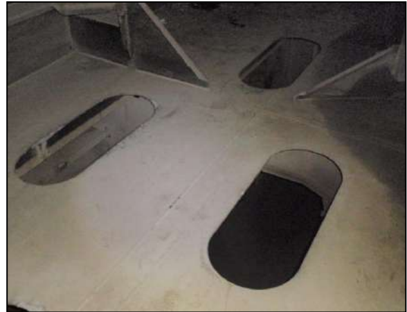
Figure 2: Configured platform nos. 1 to 4

While platform nos. 1 to 4 were fully configured platforms with access and drain openings (Figure 2), the bottom most platform no. 5 (where the accident happened) was structured differently, with deep longitudinal girders and face plates of the bottom longitudinal stringer (Figure 3).