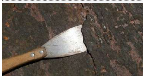
Example of loose scale