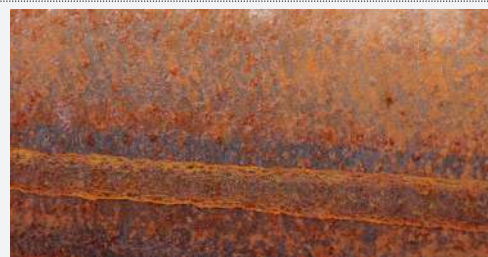
Example of oxidisation rust which would not affect the cargo