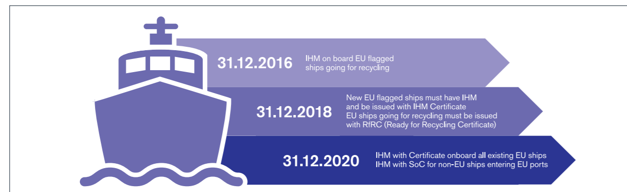
Figure 1 EU Regulation Timeline.

For facilities located in third countries (i.e. those located outside the EU) requirements and procedures for inclusion on the EU List were published by the EC in a Technical Guidance Note. By applying for inclusion on the EU List, facilities located in third countries accept that they will be subject to on-site inspections by the EC, or agents acting on its behalf.