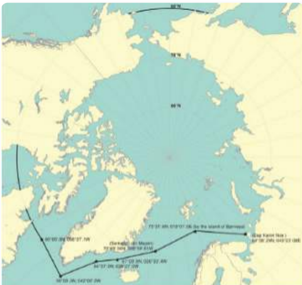
Arctic: Mostly north of 60° but with a limiting line from Greenland; south at 58°

The International Code for Ships Operating in Polar Waters (Polar Code) entered into force on the 1st January 2017 and is designed to ensure safe ship operation and protection of the polar environment. The Polar Code was made mandatory through separate amendments to the International Convention for the Safety of Life at Sea (SOLAS) and the International Convention for the Prevention of Pollution from Ships (MARPOL).