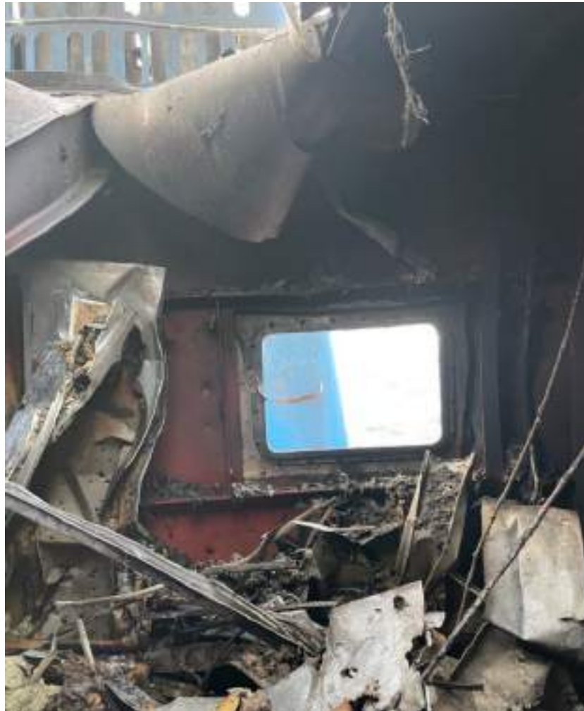
(U) Internal View of Impact Site from Iranian UAV Attack