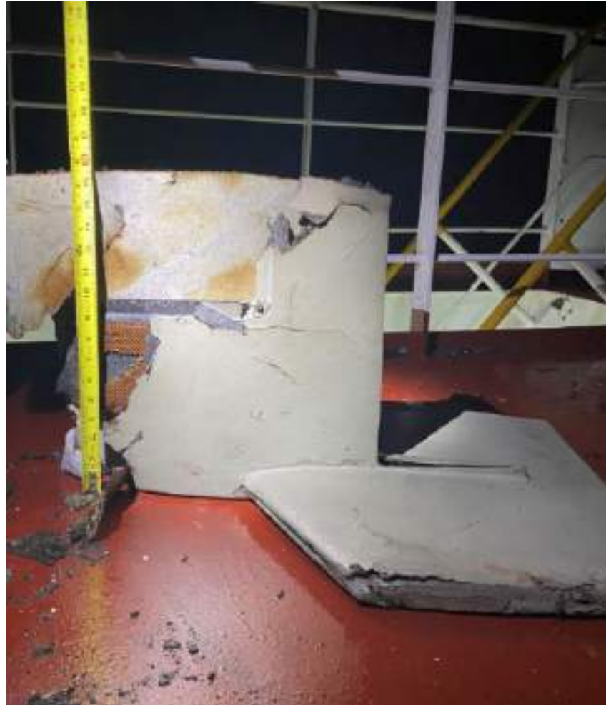
(U) Side View of Iranian UAV Fin