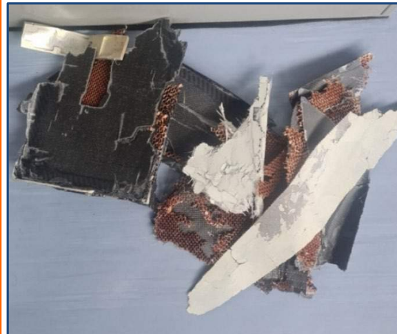
(U) Debris From Failed Iranian UAV Attack