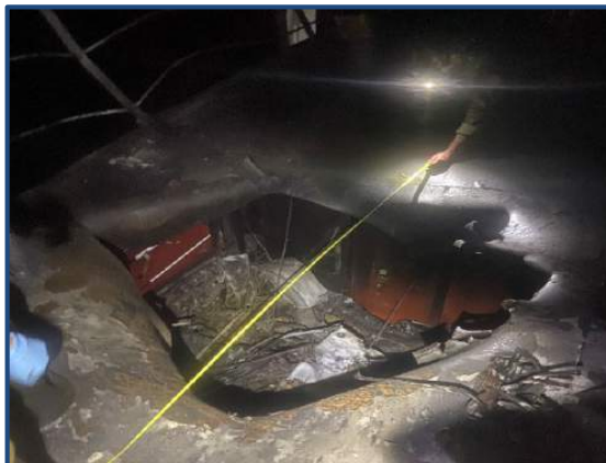
(U) EOD Site Assessment of Iranian Attack