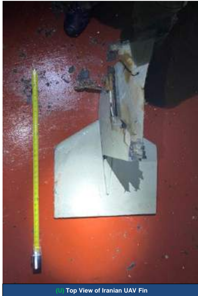
(U) Top View of Iranian UAV Fin