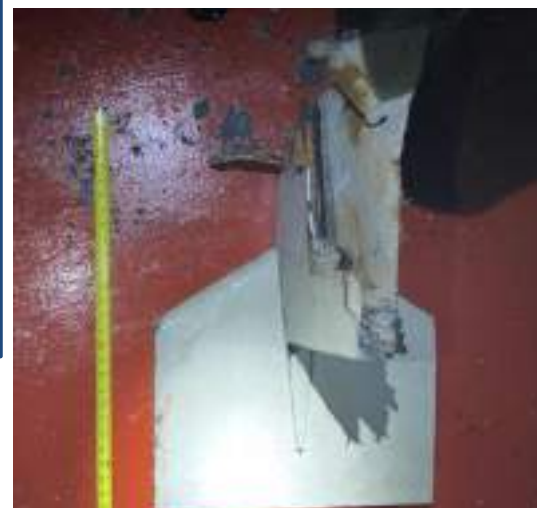
(U) Side and Top View of Iranian UAV Fin