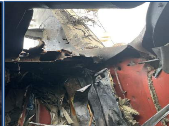
(U) Internal View of Iranian UAV Impact Site