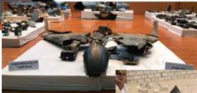
May 2019: Iranian Smaller Delta Wing UAV Used in Attack on Saudi Arabia