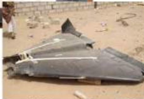
Sep 2020: Larger Iranian Delta Wing UAV Crash in Yemen

Iran has publically displayed delta wing, one-way attack UAVs consistent with UAVs observed operating across the Middle East in recent years.