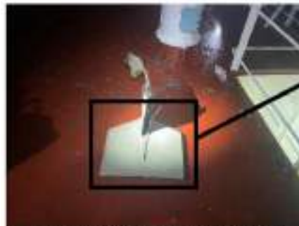
(U) From UAV on MERCER STREET