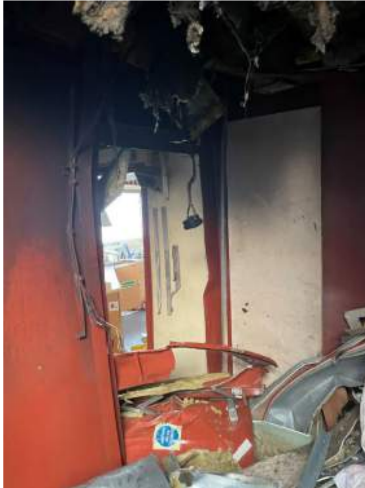
(U) Internal View of Impact Site from Iranian UAV Attack