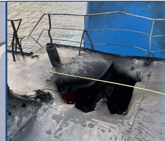
(U) Iranian UAV Impact Location