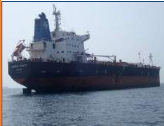
(U) M/V MERCER STREET (Stock Photo)