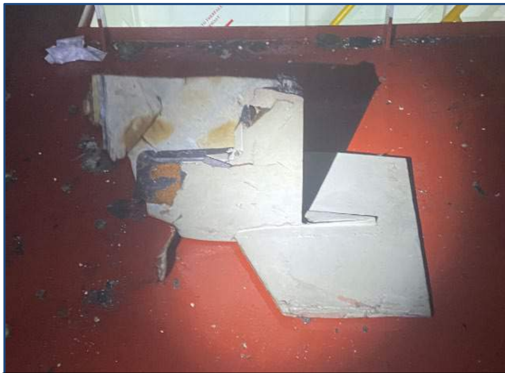
(U) Vertical Stabilizer Identical to Iranian UAV