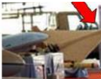
May 2014: Smaller Delta Wing UAV on Display in Iranian Airshow