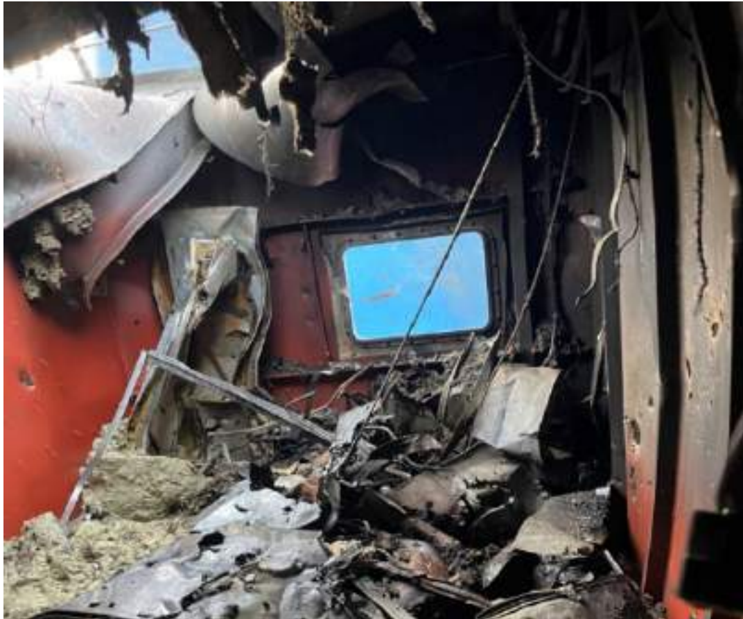
(U) Internal View of Iranian UAV Impact Site