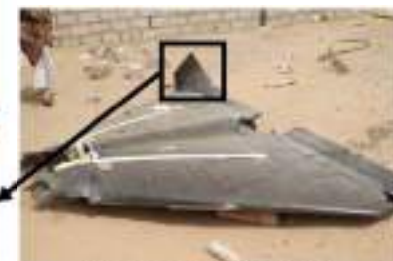
(U) Vertical Stabilizer on Iranian UAV

FORENSIC CONCLUSIONS: 1) Verified components of the Iranian one-way attack UAV were identical to previously identified Iranian unmanned one-way attack systems, and 2) Confirmed the Iranian UAV was explosive laden.