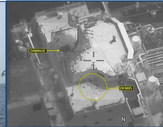
(U) Damage Caused by Iranian UAV Attack