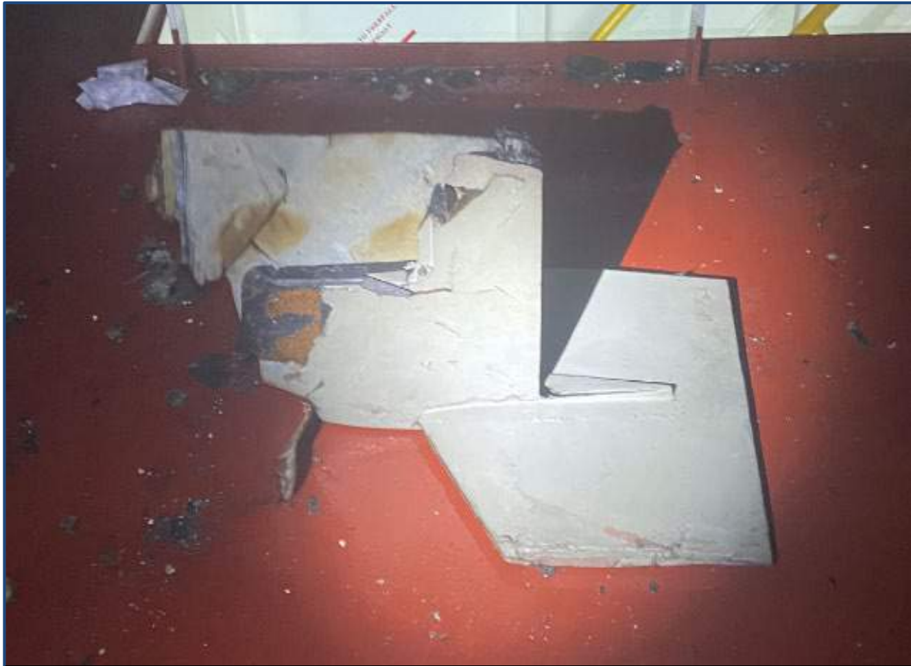
(U) Vertical Stabilizer Identical to Iranian UAV