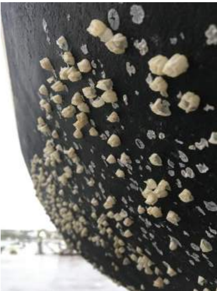
Barnacle growth on a ship hull.

Overall, the report clearly shows how the perceived impact of biofouling is likely to have been historically underestimated by the shipping community