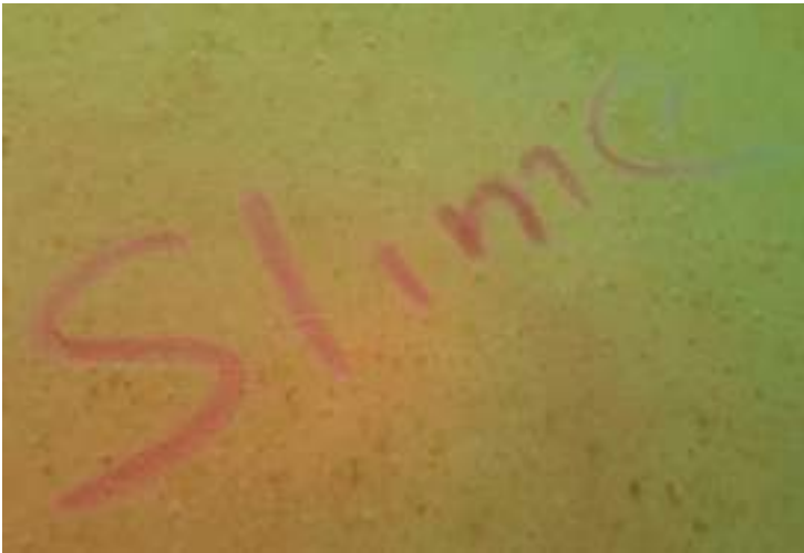
A layer of slime, typically microalgae.

For more severe biofouling conditions, such as a light layer of small calcareous growth (barnacles or tubeworms), an average length container ship can see an increase in GHG emissions of up to 55% , dependent on ship characteristics and speed.