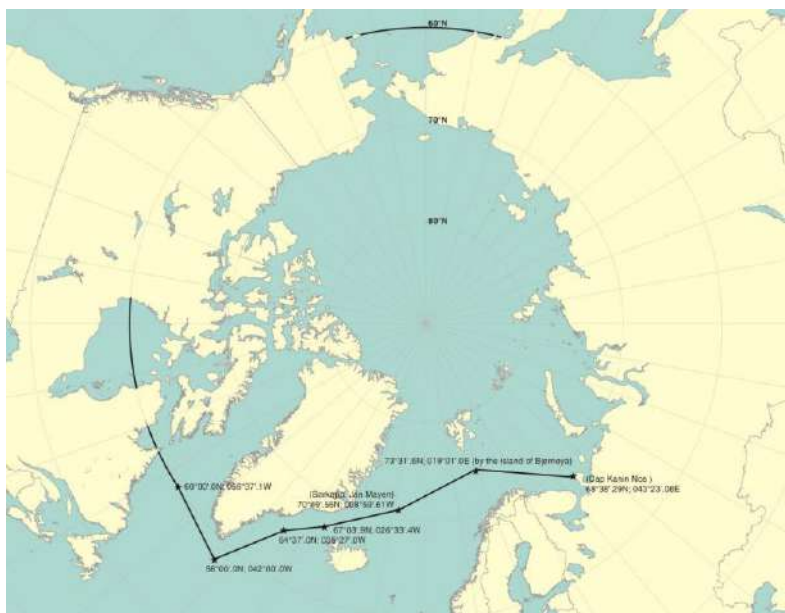
Waters located north of a line from the latitude 58°00'.0 N and longitude 042°00'.0 W to latitude 64°37'.0 N, longitude 035°27'.0 W and thence by a rhumb line to latitude 67°03'.9 N, longitude 026°33'.4 W and thence by a rhumb line to the latitude 70°49'.56 N and longitude 008°59'.61 W (Sørkapp, Jan Mayen) and by the southern shore of Jan Mayen to 73°31'.6 N and 019°01'.0 E by the Island of Bjørnøya, and thence by a great circle line to the latitude 68°38'.29 N and longitude 043°23'.08 E (Cap Kanin Nos) and