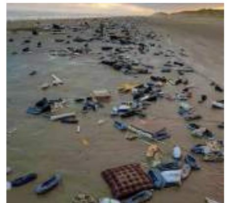
Environmental impact from the MSC Zoe incident. Image supplied.