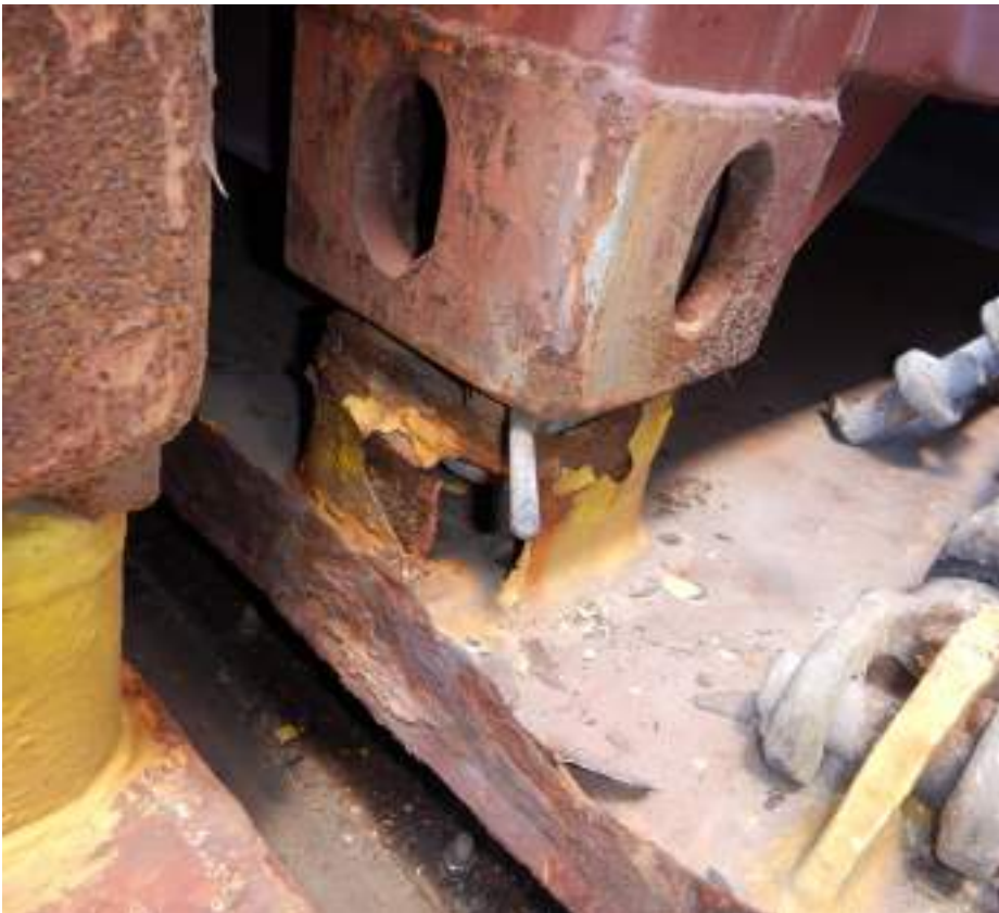
Corroded and cracked raised ISO socket.

Containers must be stowed and secured for the most severe weather conditions which may be expected for the intended voyage. Actions to increase lashings should also be considered before conditions deteriorate to the point that they are required.