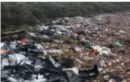
Environmental impact from the YM Efficiency incident. Image supplied.