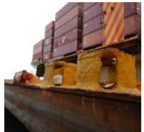
Corroded raised ISO sockets.