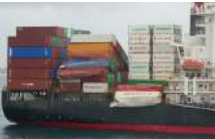
Containers on the YM Efficiency toppled over and falling into the sea. Image supplied.