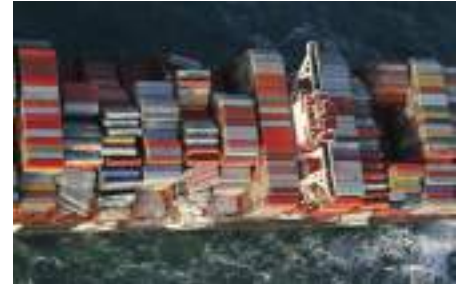
Containers on the MSC Zoe toppled over and falling into the sea. Image supplied.

The loss of containers resulted in environmental damage to the Wadden Islands, Netherlands, which are considered to be a unique and vulnerable natural habitat.