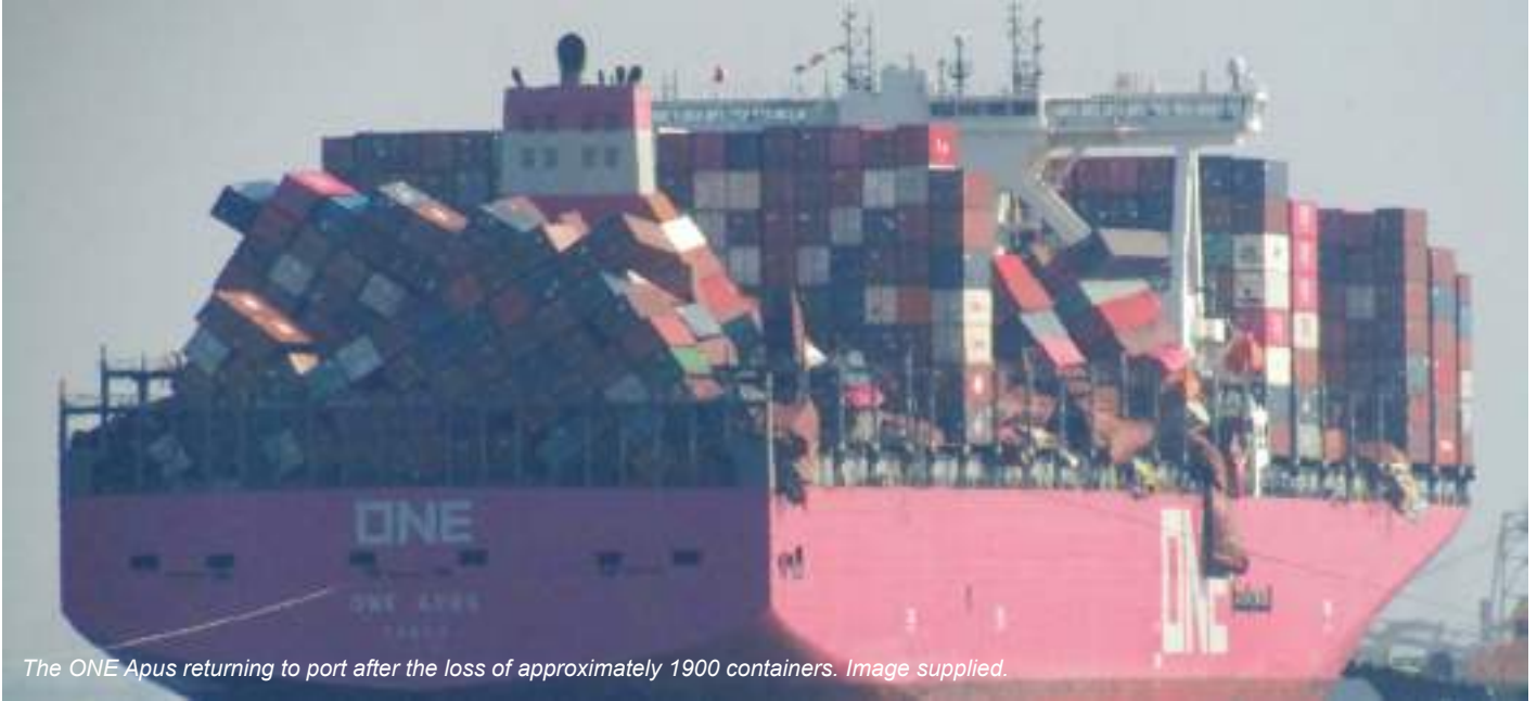
The ONE Apus returning to port after the loss of approximately 1900 containers.

This issue focuses on the risk of losing shipping containers at sea, its impact on safety and the environment, and what measures should be considered to prevent it from happening. This includes: