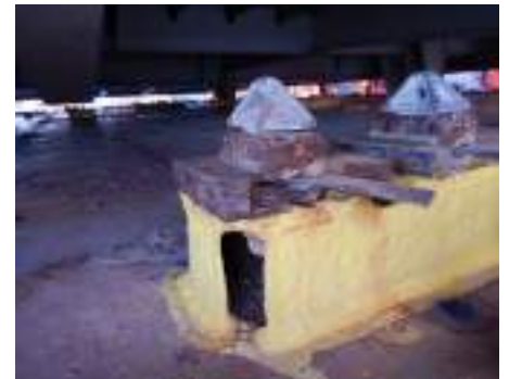
Corroded raised ISO sockets.