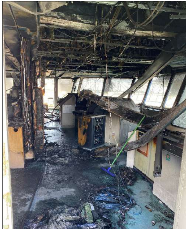
Figure 3. The damage to the bridge.

At 1527:54 local time, the footage showed an orange flash immediately followed by a puff of smoke by the communications table. Following the initial flash, the video showed smoke rising up and increasing in volume and thickness.