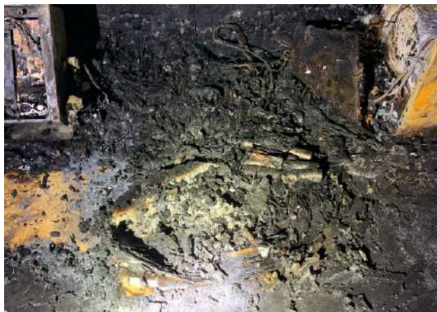
Figure 7. The remains of the lithium-ion and nickel-metal hydride battery chargers on the communications table.

All six of the nickel-metal hydride battery cells were found among the charger remains and exhibited fire damage. Of the remains of the two lithium-ion batteries on the communications table, two cells from the same battery were found among the charger remains and had sustained fire damage. Although investigators found components of the second lithium-ion battery among the charger remains, its two cells were not found.