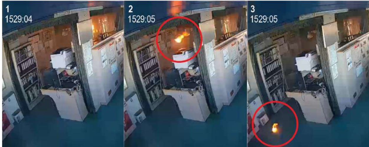
Figure 5. Photos from the bridge closed-circuit camera showing (1) a second explosion, (2) an object on fire propelled into the air (circled in red), and (3) the object, still on fire, landing on the floor (circled in red).

In the video, the fire on the communications table continued to grow. The visibility on the bridge decreased rapidly, and the camera lens became covered in ash and started to deform at 1536:26, preventing any further view of the fire within the bridge.