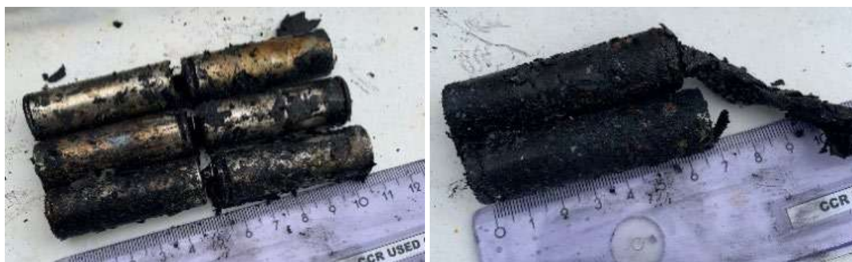
Figure 8. The nickel-metal hydride battery's cells ( left ) and remains of the lithium-ion battery cells and components ( right ) found on the communications table.