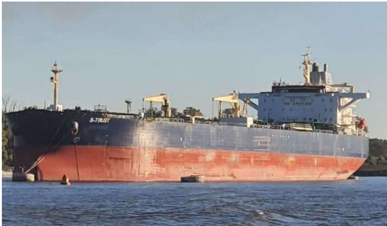
Figure 1. S-Trust at anchor following the casualty.

On November 13, 2022, about 1530 local time, a fire started on the bridge of the oil tanker S-Trust while the vessel was docked at the Genesis Port Allen Terminal in Baton Rouge, Louisiana. 1 Fire teams from the vessel's crew extinguished the fire about 1550. There were no injuries, and no pollution was reported. The damage to the vessel was estimated at $3 million.