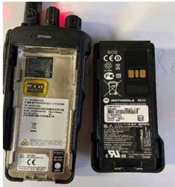
Figure 6. A Motorola DP4400e radio and lithium-ion battery used on the bridge of the S-Trust .

A postcasualty battery inventory identified that the vessel carried twenty-seven 7.4-volt batteries for the radios: 14 of the batteries had lithium-ion cells, and 13 of the batteries had nickel-metal hydride cells. The vessel also had 16 battery chargers: 8 for lithium-ion batteries and 8 for nickel-metal hydride batteries; 6 of the lithium-ion chargers were Motorola