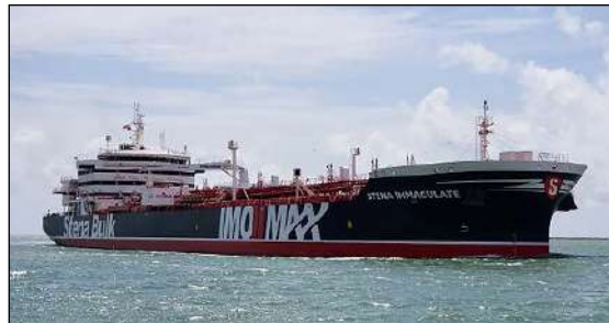
Figure 1: Stena Immaculate