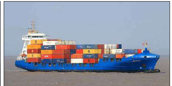
Figure 2: Solong