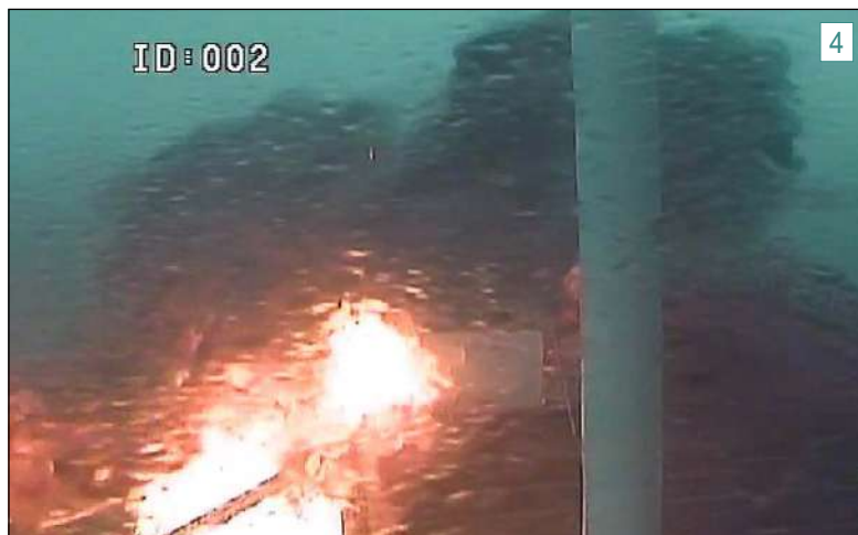
Figure 4: Initial collision